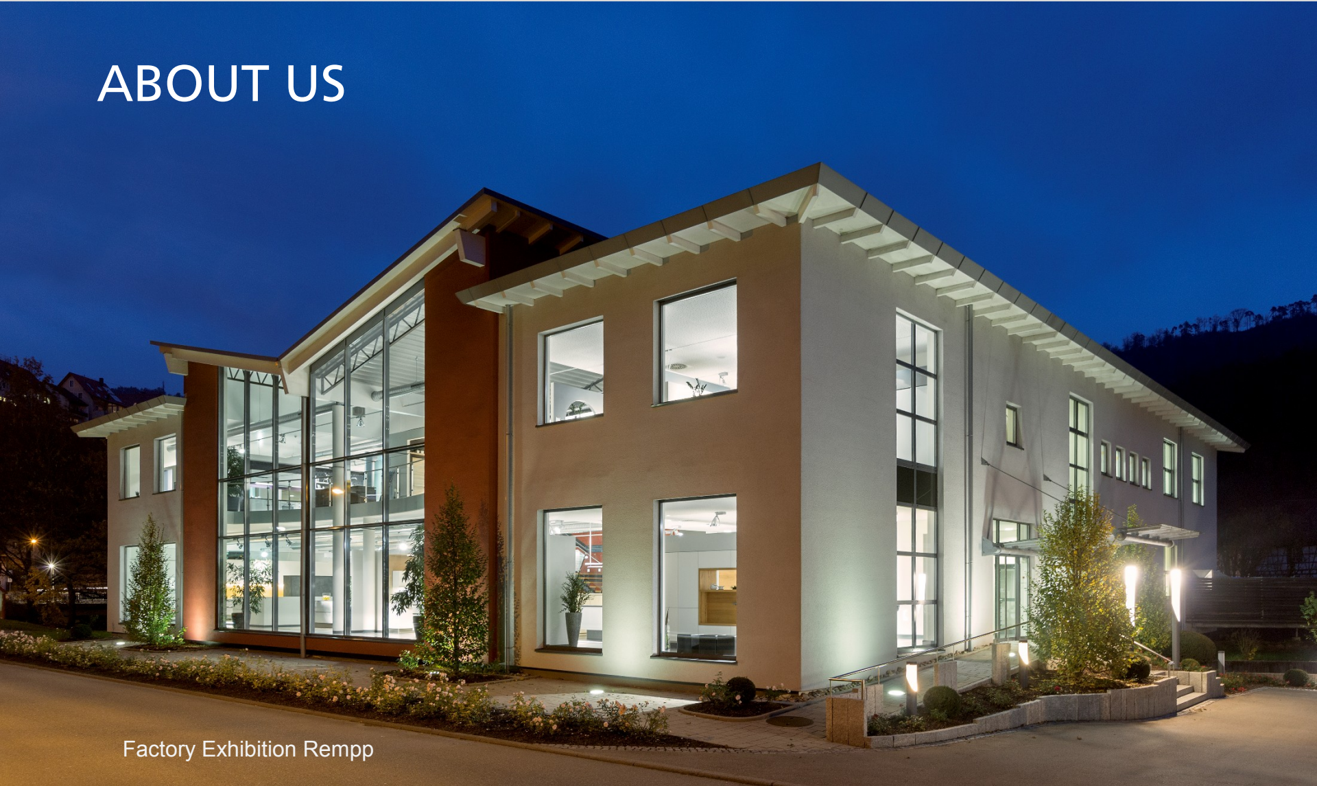
Factory Exhibition Rempp