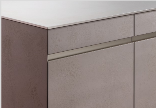
Handle Bar AGE 7