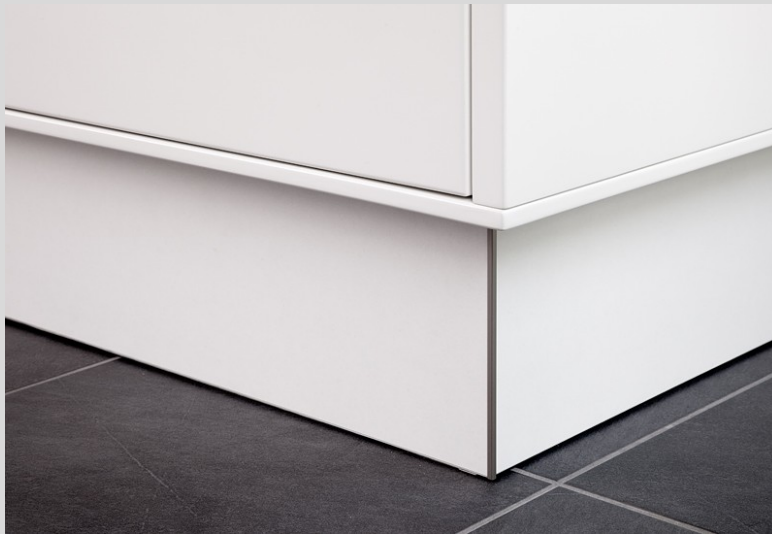
Base corner with aluminum profile mitred