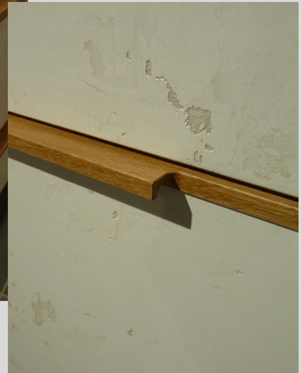
Wooden handle bar milled sideways