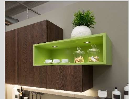
Shelf, cupboard notch