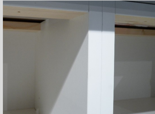
Solid wood traver