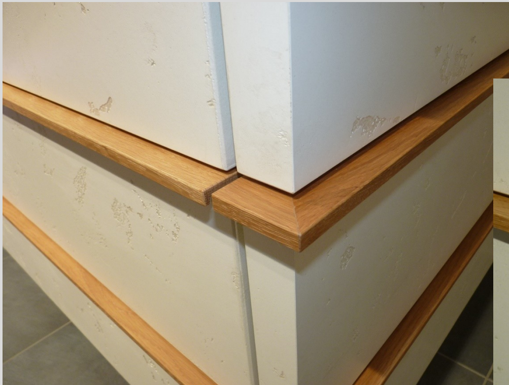
Wooden handle bar with side framing