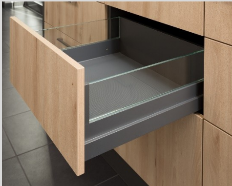
Extension with standard glass side skirt