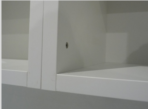
Cabinet body sides + shelves 19 mm thick