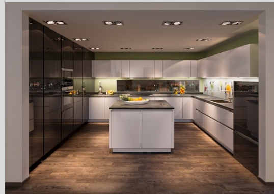
C-Line horizontal / vertical