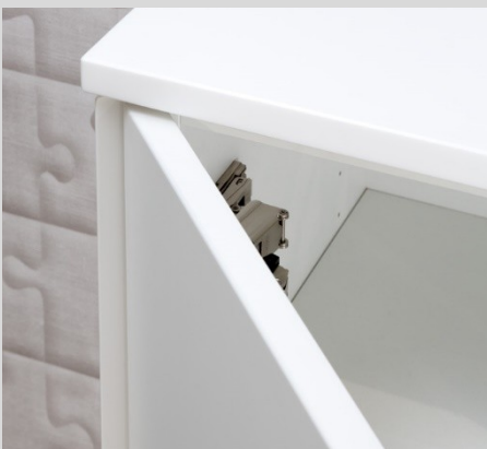
Mitre door with wide angle hinge