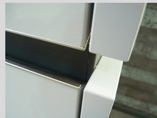
X-Line, Pocket milling