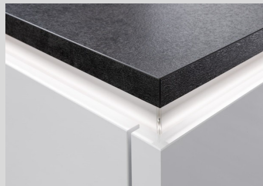
C-Line Sides- doubling