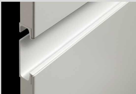
Handle Bar AGE 7 powdercoated