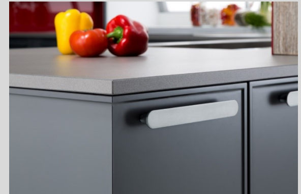
Angled door mitred glued