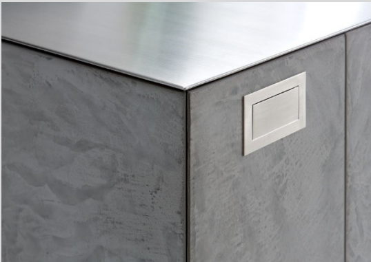
Phoenix trowelled, side door mitred