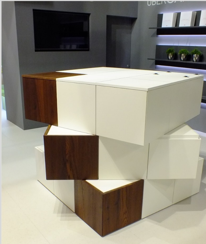
Function-Cube Living Kitchen 2017