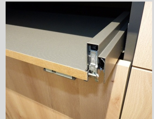
Flat drawer Scala