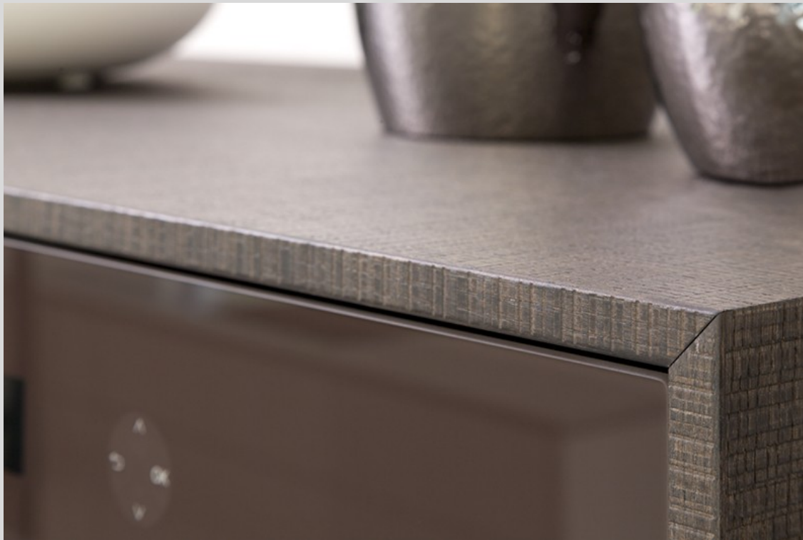
13 mm Framing on mitre