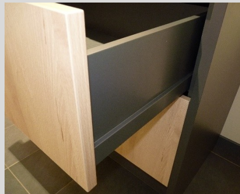
Extension with high metal side skirt