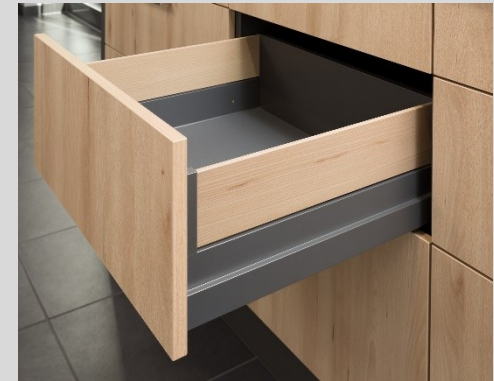
Extension with side skirt core ash