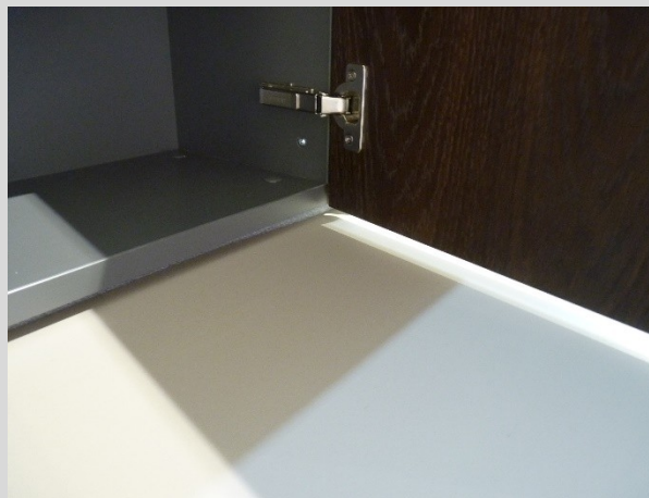
Cabinet body interior diamond-graphite