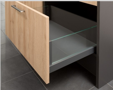
Extension with high glass side skirt > MP