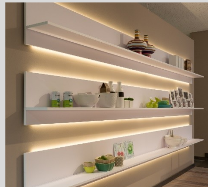
T-shelf with LED lighting