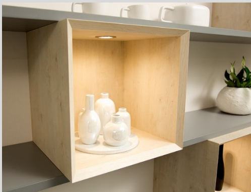
Facet shelf - elegant design