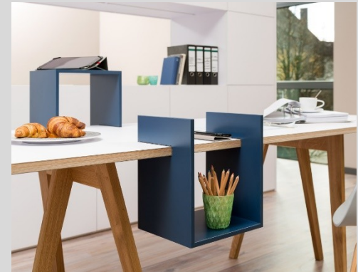
Monkey - variable use in different residential situations...