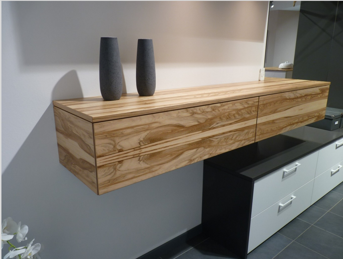
Arco Satin nut