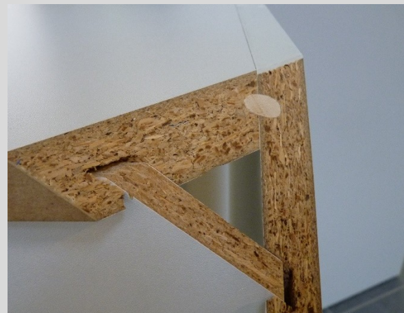
Rear wall 8 mm thick