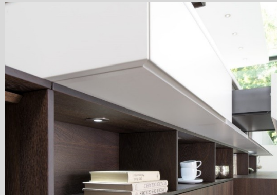
Toronto X-Line, lateral mitre