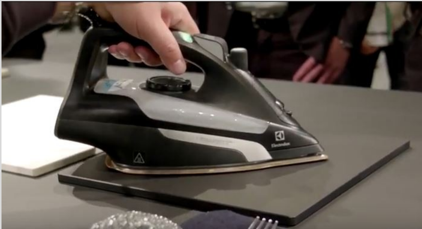
Fenix Laminated with repairable surface